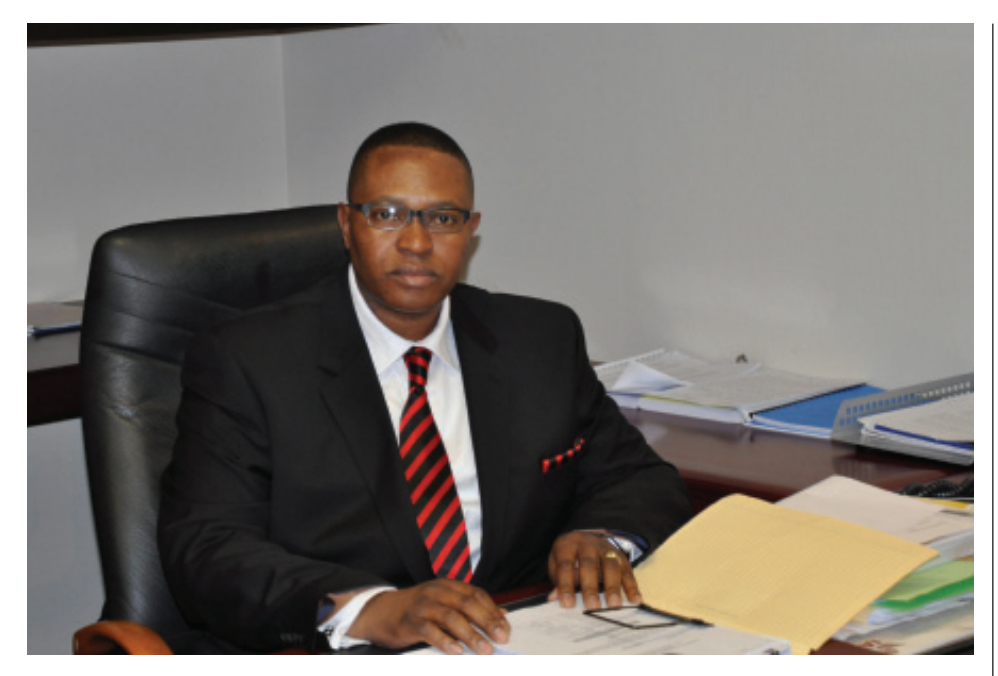
MEC Norman Mokoena

he Ministerial Task Teams that were dispatched to the province in August 2009 to investigate the backlogs facing municipalities which could have led to the service delivery protest have finalised their work and submitted a comprehensive report on the state of Local Government. The report has indicated a number of findings which include the following: