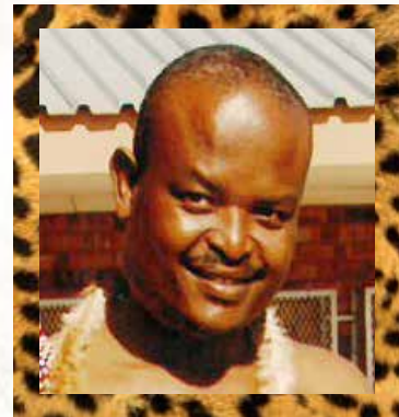
INKHOSI SA NKOSI