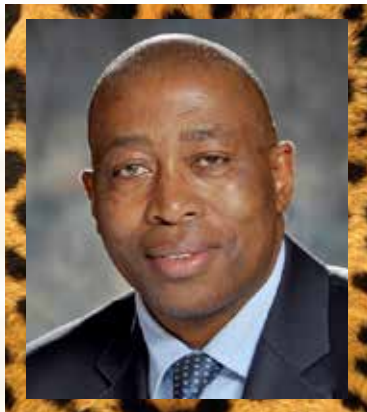
Mr Speed Mashilo (MPL) MEC: COGTA

The implementation of the Community Development Programme (CWP) as a poverty relief measure in areas under the jurisdiction of Amakhosi has created a social net income for households struggling to make ends meet. Since the introduction of the programme in 2016, 1815 short term opportunities have been created. 150 projects are being implemented in the areas of each of the two Kings (of the Ndebele nation) and 100 in each area of targeted 17 traditional leaders. The programme is a major relief for our communities subjected to the grinding effects of poverty due to the lack of economic activities in rural areas. We are working very close with Amakhosi to make this a reality and the recorded progress thus far is an indication of the importance of a partnership between government, Amakhosi and all community structures. We commend Amakhosi for playing a crucial relief intervention.