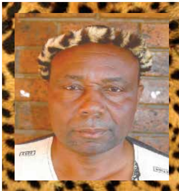
KGOŠI NS MOGANE