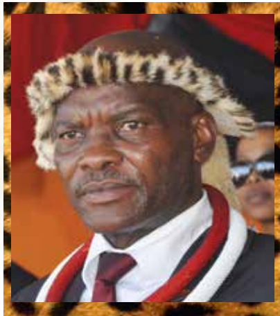
INGWENYAMA MAKHOSOKE II