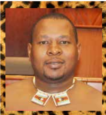
INKHOSI RA NKOSI