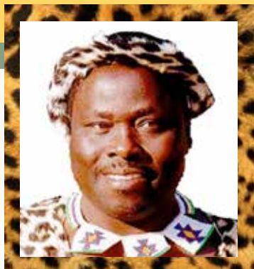
INKHOSI RM MBUYANE