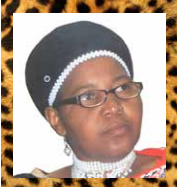
INKHOSIKATI B HLATSHWAKO