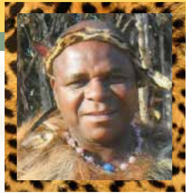
INKHOSI SH MKHATSHWA