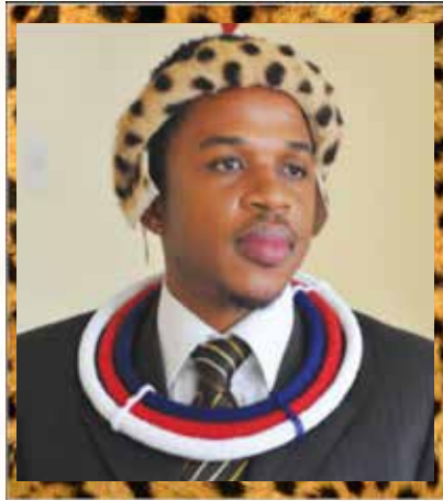
INGWENYAMA MABHOKO III