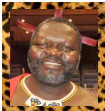
INKHOSI MLAMBO II