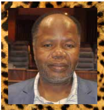
PRINCE CM DLAMINI